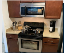
Fully equipped kitchens to reduce meal spend